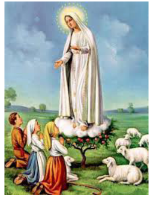
in adoration of the Lord.